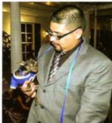
Nacho went to a loving home