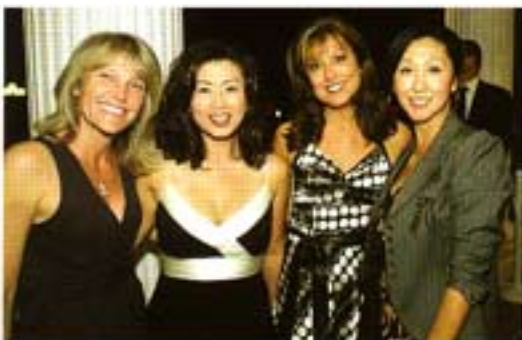
Guests enjoying the evening