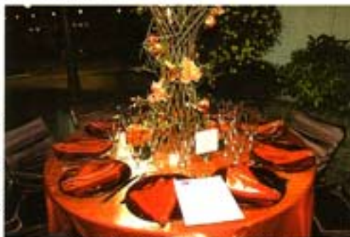
One of 18 beautiful tablescapes